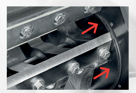
Rotary discs integral with the rotor and containment rings; bench adjustment of rotating and fixed knives. Scissors cutting configuration.