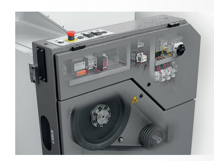
Integrated electric control panel. Safety devices and circuit in compliance with EEC Directives.