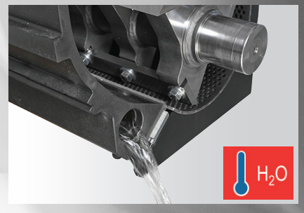
Grinding chamber water cooling; screen surface equal to approximately 50% of knives rotation length.