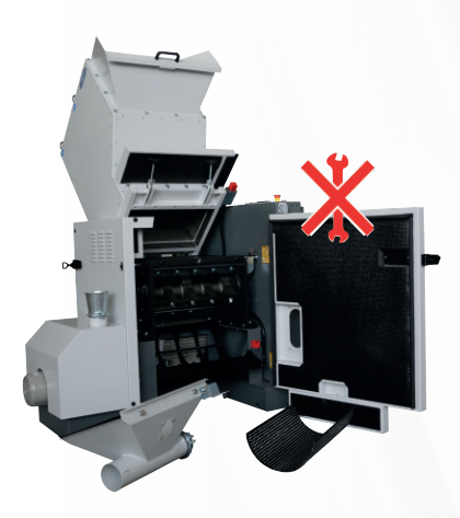
Access without tools to the parts subject to the ordinary maintenance. Moving on castors.

The granulators of this series, thanks to the special design of the grinding chamber, are also widely used for an immediate and safe inline grinding of film and trims.