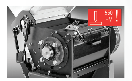
Grinding chamber in 550HV antiwear execution; hopper opening by gas cylinder.