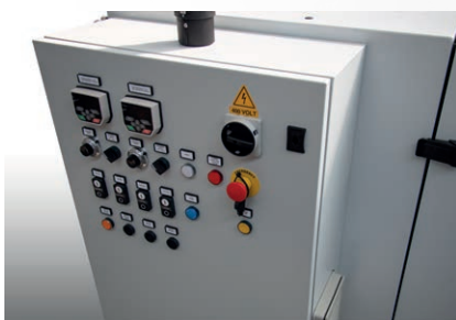
Control panel and security system integrated in the electrical panel. Operating mode AUTO / MAN with the possibility of managing the extrusion line speed signal.