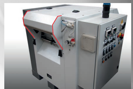
Small footprint and protection for mechanical parts in motion.