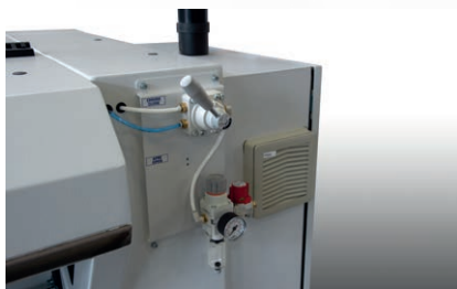
Control panel for pneumatic opening / closing of the rollers.