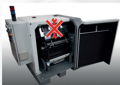
Access without tools to the parts subject to ordinary maintenance.