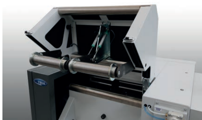
Independent pneumatic dancing arms for each roller.