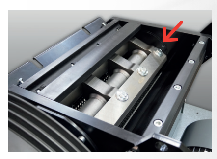
Rotary discs integral with the rotor and containment rings. Scissors cutting configuration.

Granulators dedicated to small blow molding scrap recovery. The new BM 20 series can either work off-line or in-line. The compact footprint and the available options of the hoppers style guarantees flexibility for the customer needs.