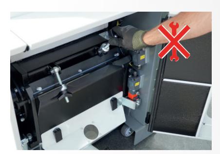
Access without tools to the main parts subject to ordinary maintenance. Moving on castors.

Grinding chamber suitable for small hollow pieces. Screen surface equal to approx. 50% of the knives rotation length.