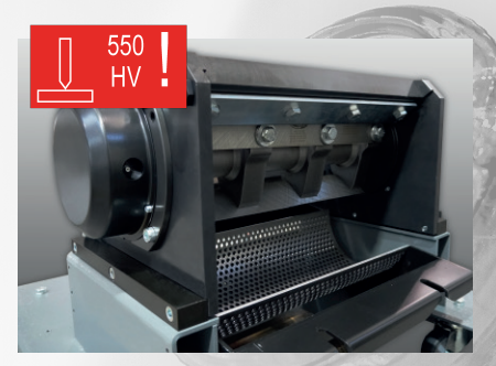
Grinding chamber in antiwear execution 550 HV.

Roller bearings mounted to the grinding chamber and fixed to the circumference.